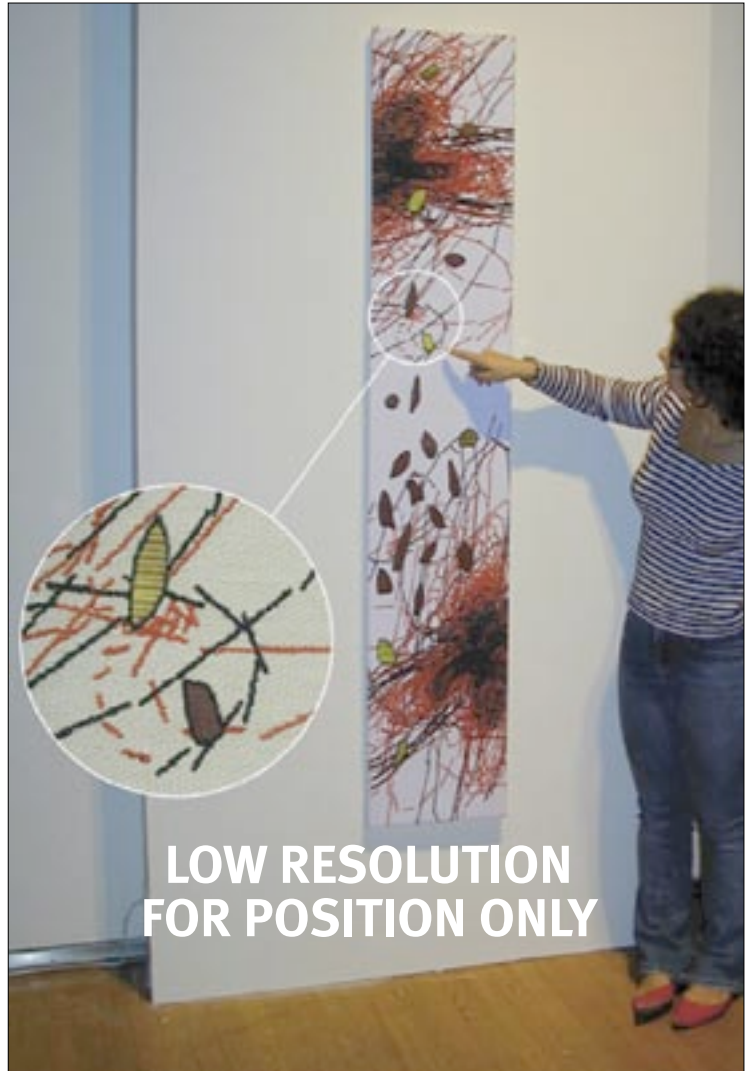
Figure 5 Shimmering Flower.

and diverse designs on a textile. Its visual properties (color and pattern) are determined by the pattern and physical configuration of the conductive/resistive yarns and the inks integrated into its surface (Figures 5–8).