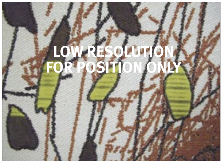
Figure 7 Shimmering Flower detail.

The aesthetics of the display mirror the soft qualities of the construction. The textile changes in a slow and contemplative