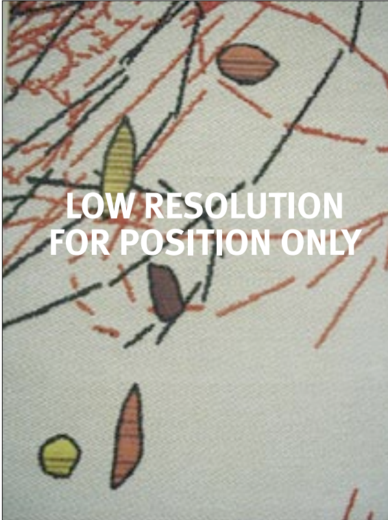
Figure 6 Shimmering Flower detail.

way, referencing the process of weaving, knitting and other textile construction techniques. Resulting imagery blurs the boundaries between digital image and textile design motif. The aesthetic of the patterns and the animation references the idea of “pixel,” traditional quilting and weaving practice, as well as emerging research in visual display technology.